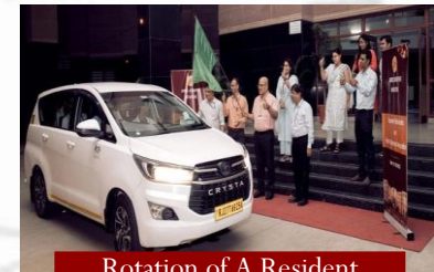
Rotation of A Resident Program