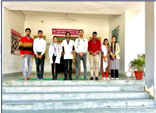
Arriving at Satellite Tribal Centre