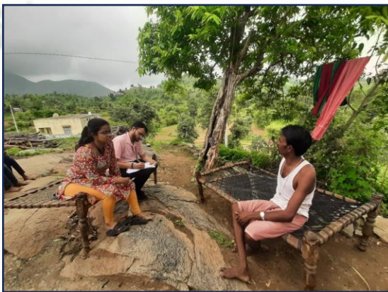
Interaction with Traditional Tribal Healer for identifying prevalent disease