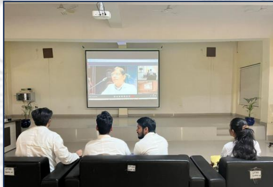
Academic Activity at Satellite Tribal Centre