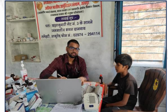
Clinical posting at CHC/ PHC