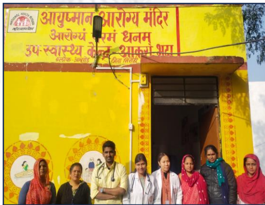
Visit at HWC